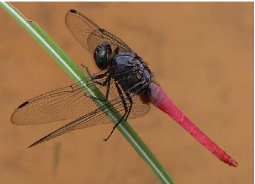
Comparison data b. Figure 5. Orthetrum pruinosum