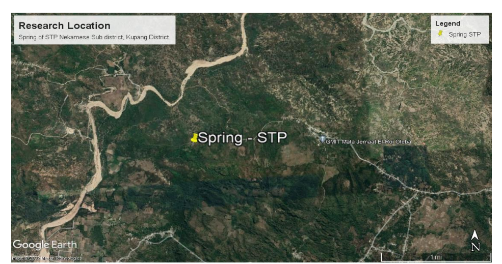
Figure 1. The odonata sampling locations

The samples were collected by using insect nets and hand sorting (Semiun & Mamulak, 2021). The obtained dragonfly samples were then photographed and put in a labeled sample bottle. Measurement of abiotic factors includes conductivity, TDS, iron, hardness, sulfate, manganese, nitrate, and nitrite.