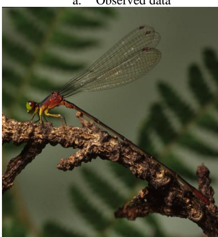
b. Comparison data Figure 4. Megalagrion sp.

Orthetrum pruinosum belongs to the Libelluloidea family. Orthetrum pruinosum is usually found at an altitude of 200 -300 m (Janra et al., 2021). However, in this study, it was found at an altitude of 152 m asl. Members of this group are very large in number, many are found around ponds and swamps. This species has an irregular flying habit. From the head to the thorax it is black, and the abdomen is bright red (Figure 5). The classification of Orthetrum pruinosum is as follows: