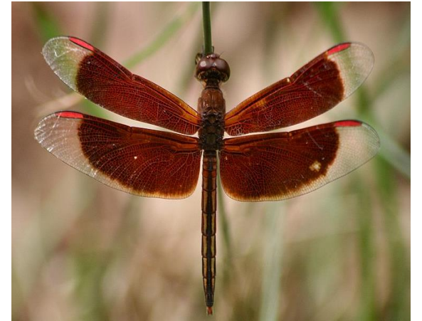
b. Comparison data Figure 2. Neurothemis stigmatizans

Coenagrion lunulatum is a species from Coenagrionidae family. This species is found in habitats such as lakes, swamps, oligotrophic to mesotrophic ponds, with an acidic to slightly acidic pH. This is in accordance with the pH of the water measured at the location of the spring which is classified as slightly acidic. The pH is acidic because there are mosses and ferns around the springs, as well as fallen plant leaves in the springs. The habitat of this species is adjacent to forests, where there is no or minimal anthropogenic activity. The dominant body color is blue, while the top of the head, thorax, and abdomen are dominated by black (Figure 3). On all four wings, there is a point which is located at the top end. The classification of Coenagrion lunulatum is as follows: