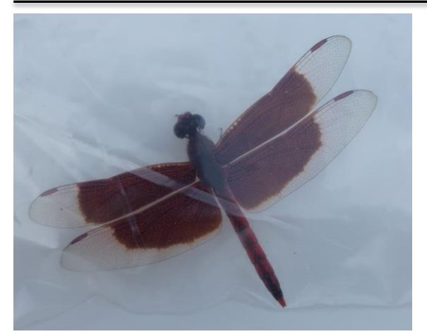
Observed data a.